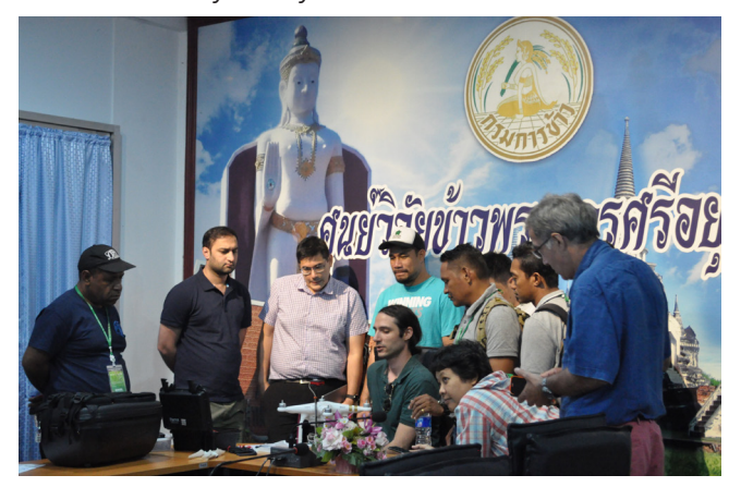
Preparing UAV for multispectral data collection at the Ayuthaya Rice Research Center (Jun. 2018)

Guinea, Timor Leste, Bhutan, the Philippines, Laos, Sri Lanka, South Korea, Pakistan, and Thailand. Members from the GIC staff delivered lectures on topics including drone mission planning, aerial image collection theory, and drone image processing. GIC staff also facilitated hands-on practical sessions for basic drone maneuvering at AIT and drone-based agricultural data collection at the Rice Research Institute in Ayuthaya, Thailand.