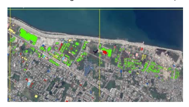
Reconstruction Monitoring In Palu, Indonesia

This training course was organized under an Asian Development Bank (ADB) funded project to assist with Indonesia's rebuilding effort in the wake of the devastating 2018 Sulawesi earthquake.