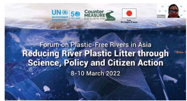
Forum on Plastic Free Rivers in Asia

CounterMeasure is a joint initiative between the United Nations Environment Program (UNEP) and the Japanese Government that aims to identify sources ofplastic pollution in Asian river basins. For more information, visit the CounterMEASURE Forumon Plastic-Free Rivers in Asia website at: <a href="http://forum2022.countermeasure.asia/index.html">http://forum2022.countermeasure.asia/index.html</a>