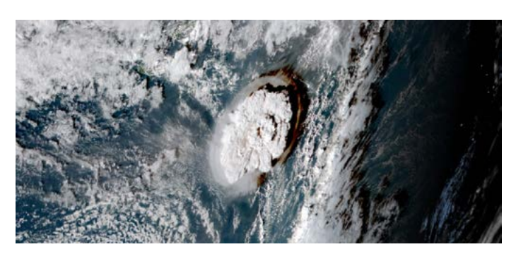
Volcano and tsunami hit Tonga in Jan 2022

From January - March 2022, GIC-AIT responded to 3 activations for tsunami (Tonga), flood (Thailand), and oil spill (Thailand) for the Sentinel Asia Program.