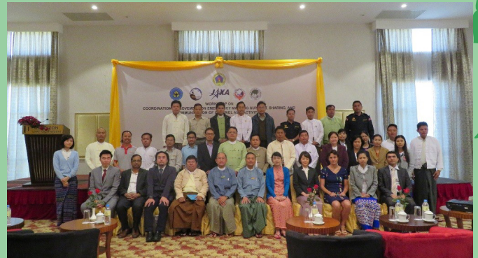
Sentinel Asia workshop in Myanmar (January, 2018)

The training course was attended by government officers from the RRD, DMH, Myanmar Forestry Department, Myanmar Department of Agriculture, and the Myanmar Fire Service Department. The content focused on introducing the participants to the fundamentals of QGIS as well the application of the QGIS plugin for quick emergency response mapping.