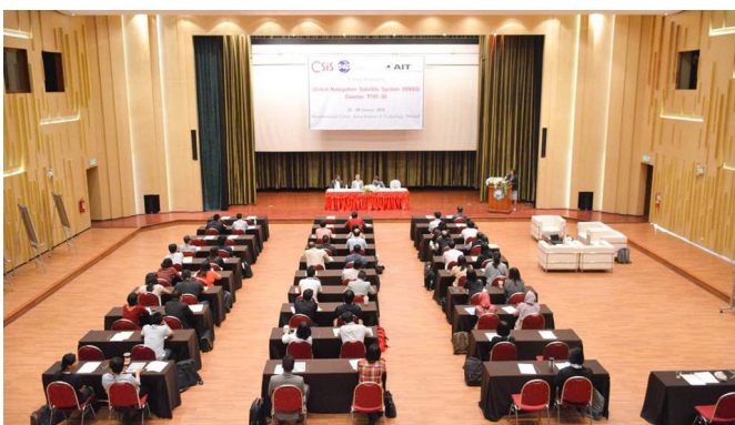
Opening ceremony of the GNSS training course (January, 2018)

During the training course participants engaged in topics including GPS signal structure, GNSS data processing for high-accuracy, using GNSS with smart-phones, and the application of GNSS data to unmanned aerial vehicles. Participants also performed practical sessions in which they collected GNSS data in the field and processed it. They used techniques learned during lecture sessions including Differential GPS (DGPS), Real Time Kinematic (RTK) Survey, and Precise Point Positioning (PPP). Due to the success of this training course, there are plans to make it an annual feature at AIT.