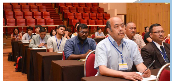
Participants engaged in GNSS training course (January, 2018)