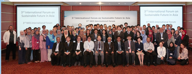
3rd International Forum on Sustainable Future in Asia hosted in Kuala Lumpur (January, 2018)

A representative from the GeoInformatics Center attended the "NIES 3rd International Forum on Sustainable Future in Asia" on January 23-24 in Kuala Lumpur, Malaysia. The Conference was organised by National Institute for Environmental Studies (NIES - Japan) and co-organized by the Integrated Research System for Sustainability Science, The University of Tokyo (IR3S, UTokyo - Japan) and The Asian Institute of Technology (AIT - Thailand). The conference focused on three main topics of sustainable futures in Asia: climate change mitigation, biodiversity, and tropical ecosystems.