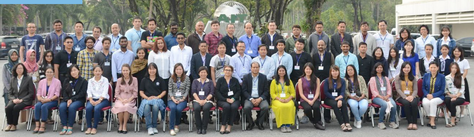
GNSS Training Participants