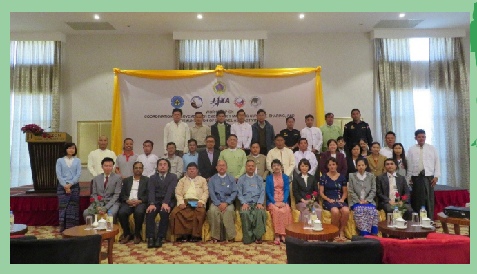
Sentinel Asia workshop in Myanmar (January, 2018)

The training course was attended by government officers from the RRD, DMH, Myanmar Forestry Department, Myanmar Department of Agriculture, and the Myanmar Fire Service Department. The content focused on introducing the participants to the fundamentals of QGIS as well the application of the QGIS plugin for quick emergency response mapping.