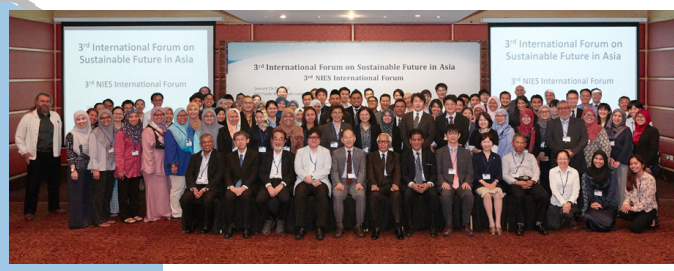
3rd International Forum on Sustainable Future in Asia hosted in Kuala Lumpur (January, 2018)

A representative from the GeoInformatics Center attended the "NIES 3rd International Forum on Sustainable Future in Asia" on January 23-24 in Kuala Lumpur, Malaysia. The Conference was organised by National Institute for Environmental Studies (NIES - Japan) and co-organized by the Integrated Research System for Sustainability Science, The University of Tokyo (IR3S, UTokyo - Japan) and The Asian Institute of Technology (AIT - Thailand). The conference focused on three main topics of sustainable futures in Asia: climate change mitigation, biodiversity, and tropical ecosystems.