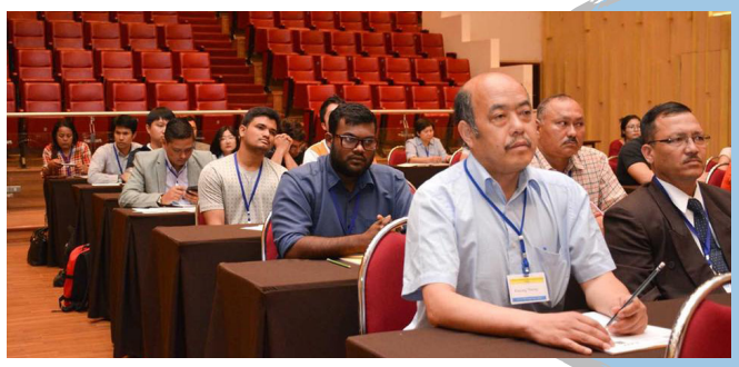
Participants engaged in GNSS training course (January, 2018)

During the training course participants engaged in topics including GPS signal structure, GNSS data processing for high-accuracy, using GNSS with smart-phones, and the application of GNSS data to unmanned aerial vehicles. Participants also performed practical sessions in which they collected GNSS data in the field and processed it. They used techniques learned during lecture sessions including Differential GPS (DGPS), Real Time Kinematic (RTK) Survey, and Precise Point Positioning (PPP). Due to the success of this training course, there are plans to make it an annual feature at AIT.