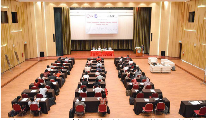
Opening ceremony of the GNSS training course (January, 2018)

The Geoinformatics Center's first GNSS (Global Navigation Satellite Systems) Training was held at the AIT Conference Center from January 23 – 26th, 2018. AIT welcomed 67 participants from 15 countries from around Asia for the four day training course. Trainers included some of the most renowned in the field of GNSS hailing from the United States of America, Japan, Australia, and Austria.