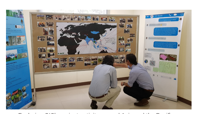
Exploring GIC's project activity around Asia and the Pacific