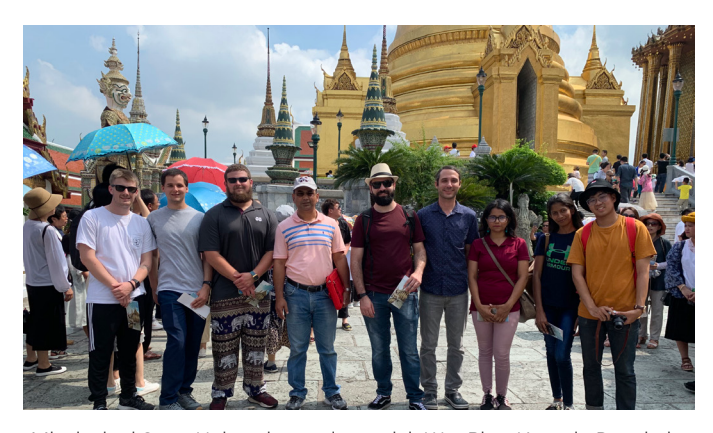
Mississippi State University students visit Wat Phra Kaew in Bangkok

While the students came from a variety of engineering backgrounds, they found the study abroad experience a valuable addition to their university education. Geoinformatics lessons in combination with cultural stops through Thailand made for a unique learning experience, providing perspectives into a new culture and field of study.