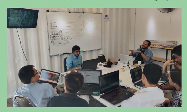
UAV data processing session at the International Sustainable Development Studies Institute

Understanding Risk is a nonprofit organization that is addressing disaster risk assessment through community involvement. The community is vast, consisting of over 9,000 professionals in the geospatial and disaster prevention community from across the globe. To learn more please visit <a href="https://understandrisk.org">https://understandrisk.org</a>