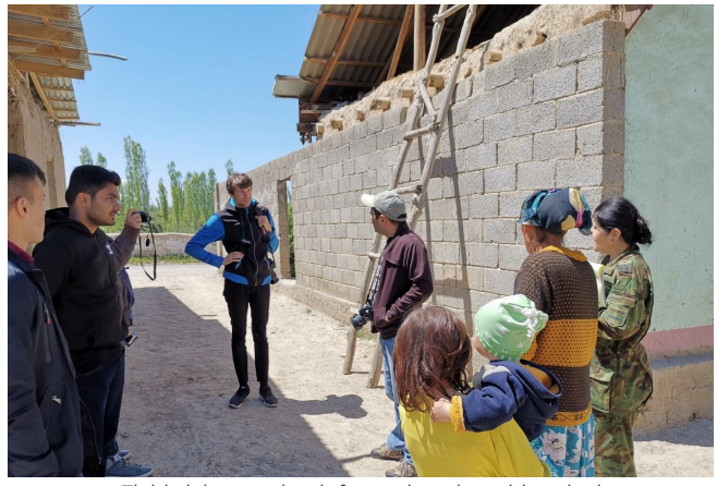
Field visit to gather information about historical disasters in the area

Elements at risk and mapping proper categorization of settlements plays an important role in the risk assessment result. Therefore, to familiarize with the existing local conditions of different types of settlements in Tajikistan, a field trip was organized on May 4 - 5, 2019 from Dushanbe to Khujand covering the entire Soughd region. The total journey was about 700km through several major and minor human settlements. Settlements visited included (highest Dushanbe population), (second highest population), Istravashan (third highest population), Buragen, Shakhristan, Pashchi, Dashtikhon, Kurkat, and Daliyoni Poyon.