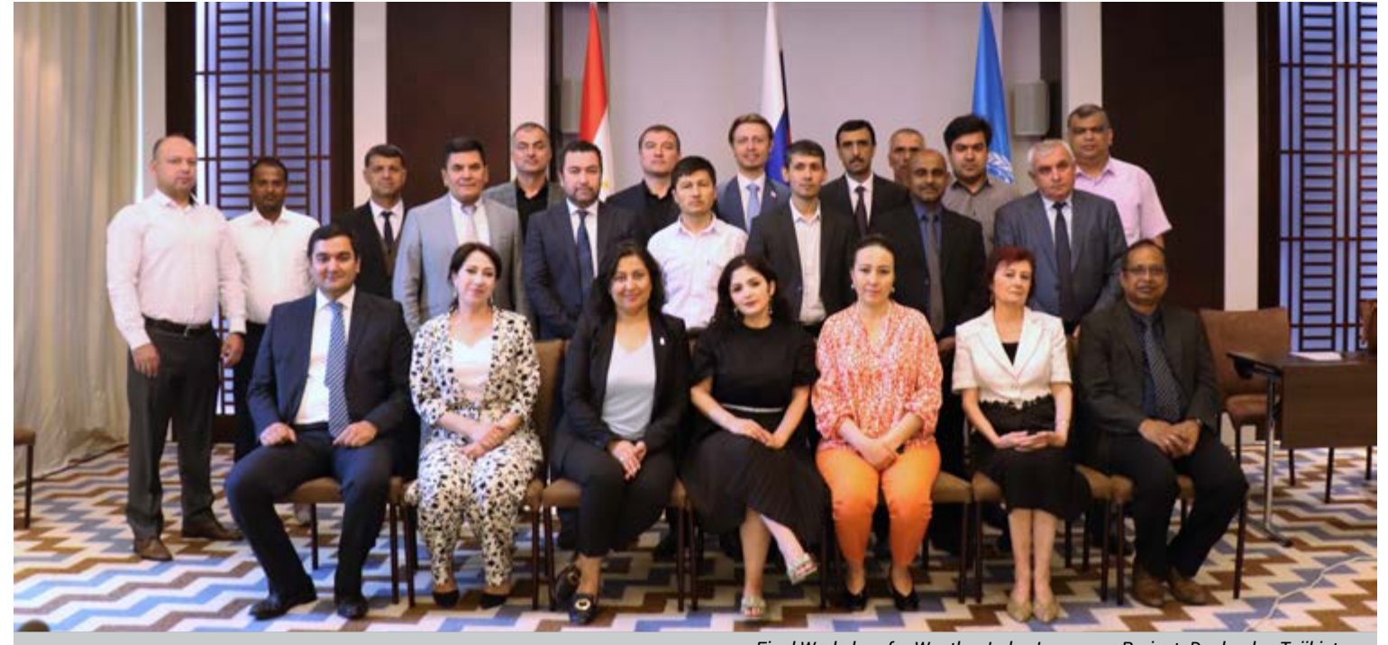
Final Workshop for Weather Index Insurance Project -Dushanbe, Tajikistan